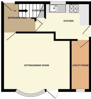
GROUND FLOOR 346 sq.ft. (32.2 sq.m.) approx.